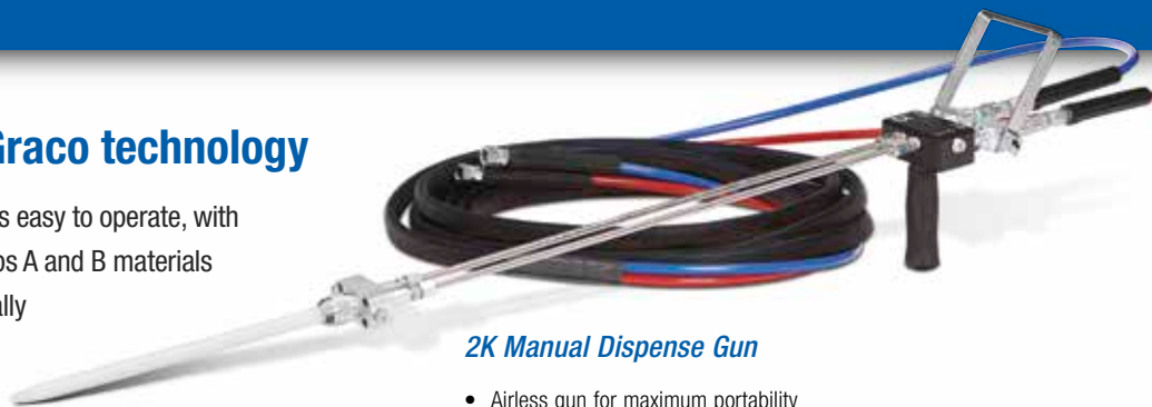
2K Manual Dispense Gun

Graco's 2K Manual Dispense Gun is easy to operate, with a single handle that starts and stops A and B materials simultaneously. Designed specifically for flooring applications.