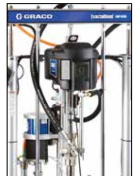
ExactaBlend AGP U100 for Urethanes