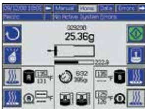
Recirc Mode option prevents materials from setting overnight