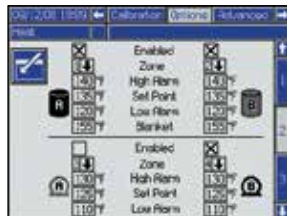
Set-up screen gives users easy access heat options